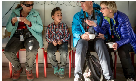
Talk to and not about the people you meet