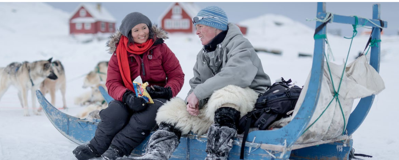
Part of traveling is learning about people and cultures you meet.

Many of the countries and regions in the North Atlantic and the High Arctic are characterized by vast wilderness areas and a diversity of people, cultures and societies. Here you will find communities featuring a wide variety of lifestyles, from large urban towns to small and very remote communities. Indigenous peoples, often in iconic traditional costumes, follow centuries-old ways of life – hunting, trapping and fishing – and are all part of today's North. But so are the urban centers, featuring modern industry and high technology. Infrastructure varies, and in some areas accessibility to communities may be difficult due to remoteness. But in most places access to mass media and Internet is highly developed, ensuring the rest of the world is only a keystroke away.