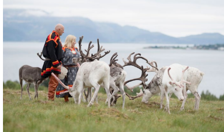
Part of traveling is learning about people and cultures you meet