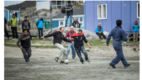
Tourists meet locals in a friendly game of soccer