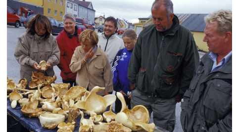
Buy local souvenirs, but ensure that you can export them to your home country