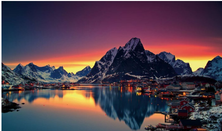
Perhaps they do not appreciate you taking photos of their private ceremony?