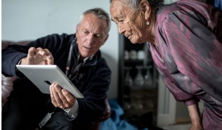
Interact with the people you meet

When visiting the North, remember that you have left home to gain new experiences and insight into the lives of others. It's important not to judge other cultures based on one's own sense of reality, norms and values. Make an effort to understand and respect the idea that cultures can be different.